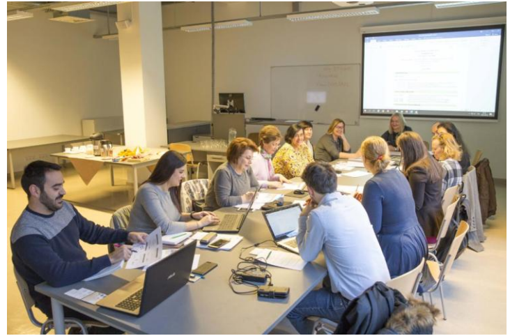
Institute of Design Technologies at Riga Technical University

Second Technical Meeting was held in Brussels on 23th of May in the premises of ECOREX company, project partner and expert in circular economy and new business models.