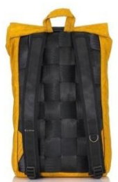
Airpaq Unicolor Yellow